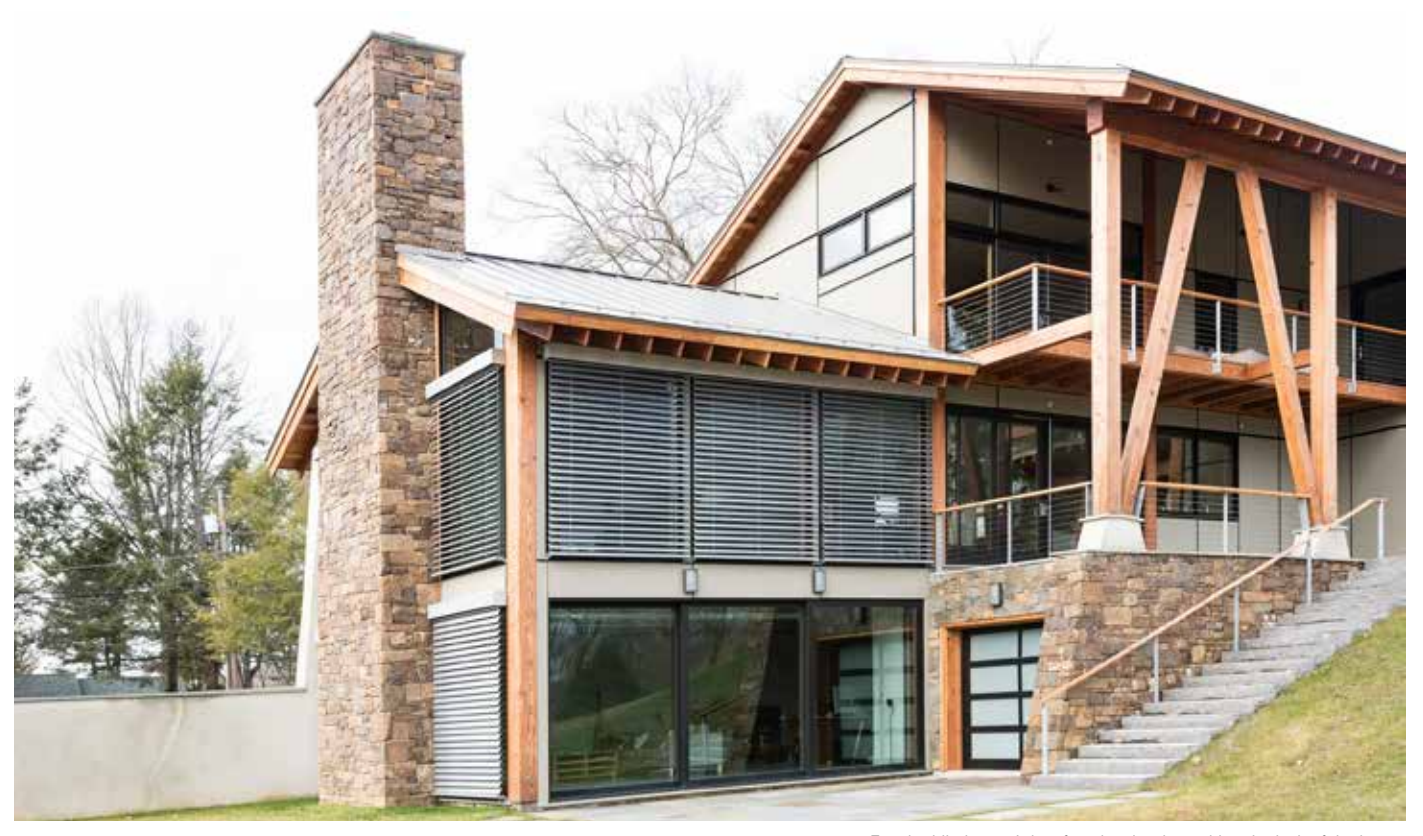
Exterior blinds aren't just functional—they add to the look of the home.

Exterior Solar Shading was their request for a new home, Draper delivered the aesthetics they wanted.