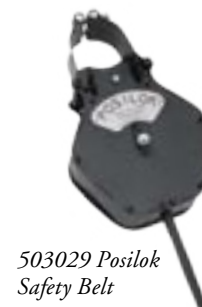
503029 Posilok Safety Belt