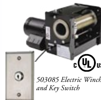
503085 Electric Winch and Key Switch