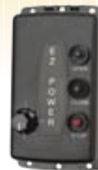
503020 Wireless Remote Control 9-Station Transmitter