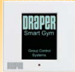
Smart Gym touch pad