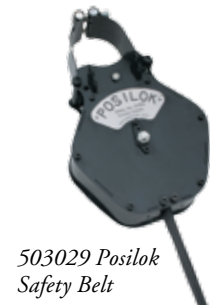
503029 Posilok Safety Belt