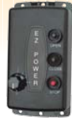
503020 Wireless Remote Control 9-Station Transmitter