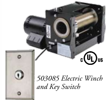
503085 Electric Winch and Key Switch