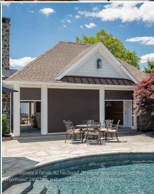
Private residence in Denville, NJ. FlexShade® ZIP exterior motorized shade with Phifer® sheerWeave® 2400 fabric in Charcoal/Chestnut.

Draper At Home shading solutions are designed to meet the standards of the most exacting homeowner.