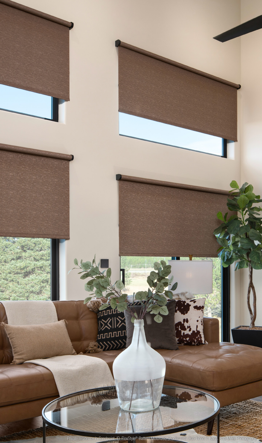
Private residence in Sandpoint, ID. FlexStyle® Battery Motorized Shades with Oslo fabric in Kora.

Each Draper At Home shade is custom manufactured and hand inspected then shipped directly from our world-class manufacturing facility in the heartland of the USA, and is backed by the industry's best warranty.