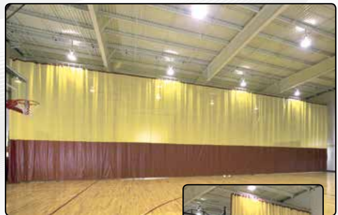
Hellstern Middle School, Springdale, AR. Architect: Wittenberg, Delony & Davidson Architects, Little Rock, AR.