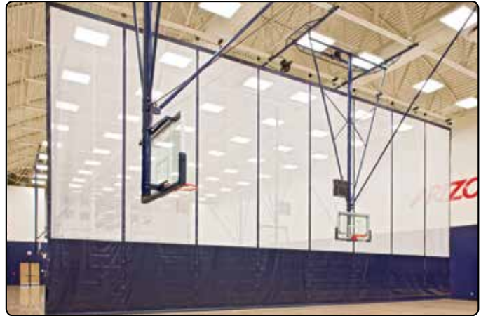
University of Arizona – Jefferson Gym, Tucson, AZ. Architect: TMP/Breckenridge Group, Tucson, AZ.